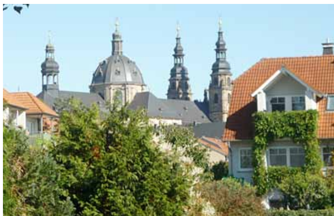
The skyline of Fulda - this image is used in their walk logo

Fulda is an attractive town, about one hour by train north east of Frankfurt airport. It dates from Roman times, and has some lovely Baroque buildings and quite a number of churches. In the cold war days, it was close to the East German border. The control centre for the walk is about 3 km from the railway station, on the outskirts of the town, and in the old American barracks complex.