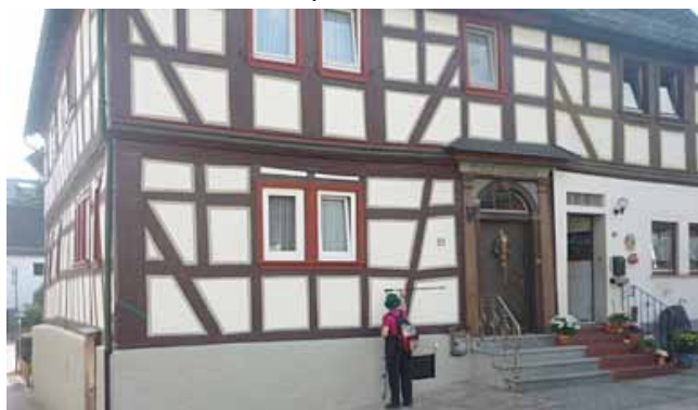
Checking the optical illusion...

We passed through Bieberheim village, where again there did not seem to be any shops - did I say last year that villages in Spain were isolated and poorly serviced?? We saw a cigarette vending machine but that was all. (Even St Goar had only one small minimart and a butcher for buying provisions though there were plenty of restaurants and a couple of tourist shops.)