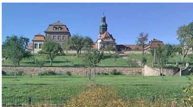
Picturesque views on the Fulda walk...

After we finished, we happily collected our awards, said goodbye to our friends and made our way back to the hotel to get ready to travel to Spain in the morning.