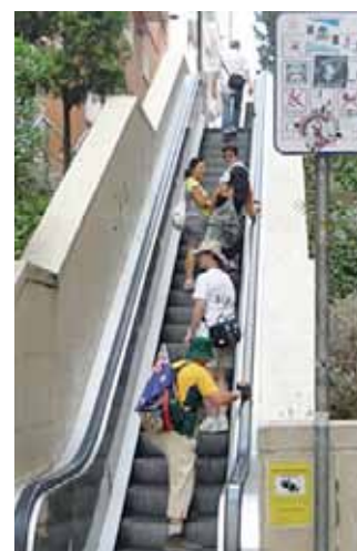
Escalators ease the climb!

After that, it was just citybashing back to the Control Centre. The city was very busy, full of traffic and very noisy - not enjoyable at all. There was a lot of stopping and starting at intersections, which were very wide. Almost back, and the map did not agree with the signage- we decided should follow the signs - that added about 1km to a course that was eventually 23km long - and we only got 20 km IVV credit. However, we are happy that we got any credits - this was the first year that the event has been IVV sanctioned.