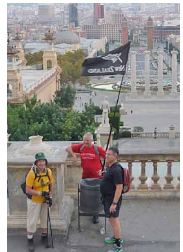
Great views from the Parliament Building

Saturday of the walk arrived, and unfortunately we could only get breakfast at the hotel from 7am. With the walk start time between 7 and 8, most people had started by the time we got to the Control Centre, near the Sants Railway Station, to enrol and collect our start cards. We climbed up to the Parliament building, on through the Botanic Gardens and then to an old fort for the first checkpoint, a climb of around 200m. After that, the route took us down again, past the Olympic Stadium and across town, via a steep valley, up to the Parc Guell. Interestingly, a local stopped to ask us what all the walkers were doing - we in Canberra aren't the only ones with a recognition problem. As we came up out of the valley, there was a bank of 5 flights of escalators, which are officially included in the route. This took a bit of the sting out of this 150m climb. I took the easy way out, but Harry did the whole climb unassisted. The Parc Guell, a show piece of a lot of Gaudi's work was the highlight of day 1, but sadly it was so jampacked with visitors so we did not enjoy it - hard to see anything.